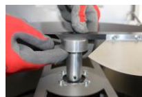
3 Adjust the blade height.