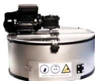
1 Container MasterTrimmer Gentle.