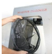
7 Insert the hoop vertically.