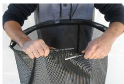
4 Until the end