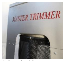
9 Attached bag.