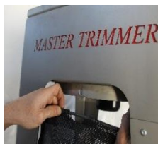
8 Attach the hoop to the hooks.