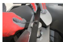
4 Tighten the central screw of the shaft.