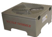
1 Block MASTERTRIMMER