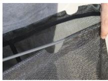
2 Insert one of the ends into the bag.