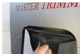
2 Bag no longer attach to hook.