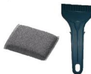
1 metal sponge + 1 cleaning spatula