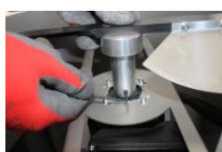
3 Tighten the screw shaft blocker