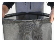
6 Hide the hitch inside the bag.