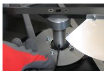
1 Loosen the lock screw shaft