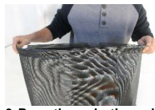
3 Pass the pole through the bag to form a hoop.