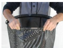
5 Connect the ends using the hitch forming a hoop.