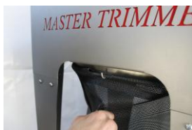
1 Pull up taking by the bag.