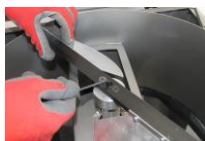
2 Loosen the central screw of the shaft.