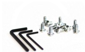
Screws and allen wrenches