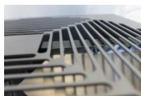
4 Close the grid and ensure that the blades don't touch the grid and they are at the desired height. (Important: keep 2mm safety distance from the grid. If not, repeat the process.)